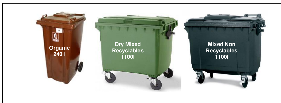
Figure 5.1 Typical waste receptacles of varying size (240L and 1100L)

The types of bins used will vary in size, design and colour dependent on the appointed waste contractor. However, examples of typical receptacles to be provided in the WSAs are shown in Figure 5.1. All waste receptacles used will comply with the IS EN 840 2012 standard for performance requirements of mobile waste containers, where appropriate.