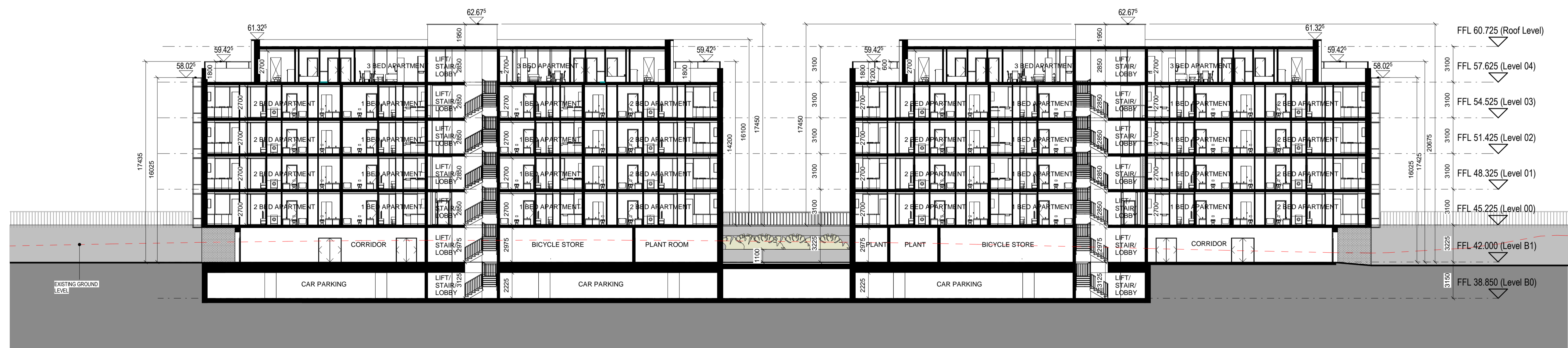
2 Section B-B 1 : 200